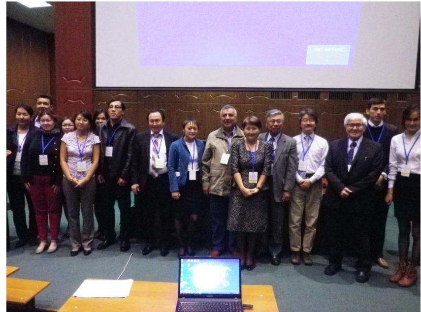
4 TH AASPP in Almaty